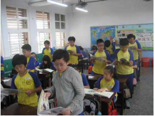
Students read the story