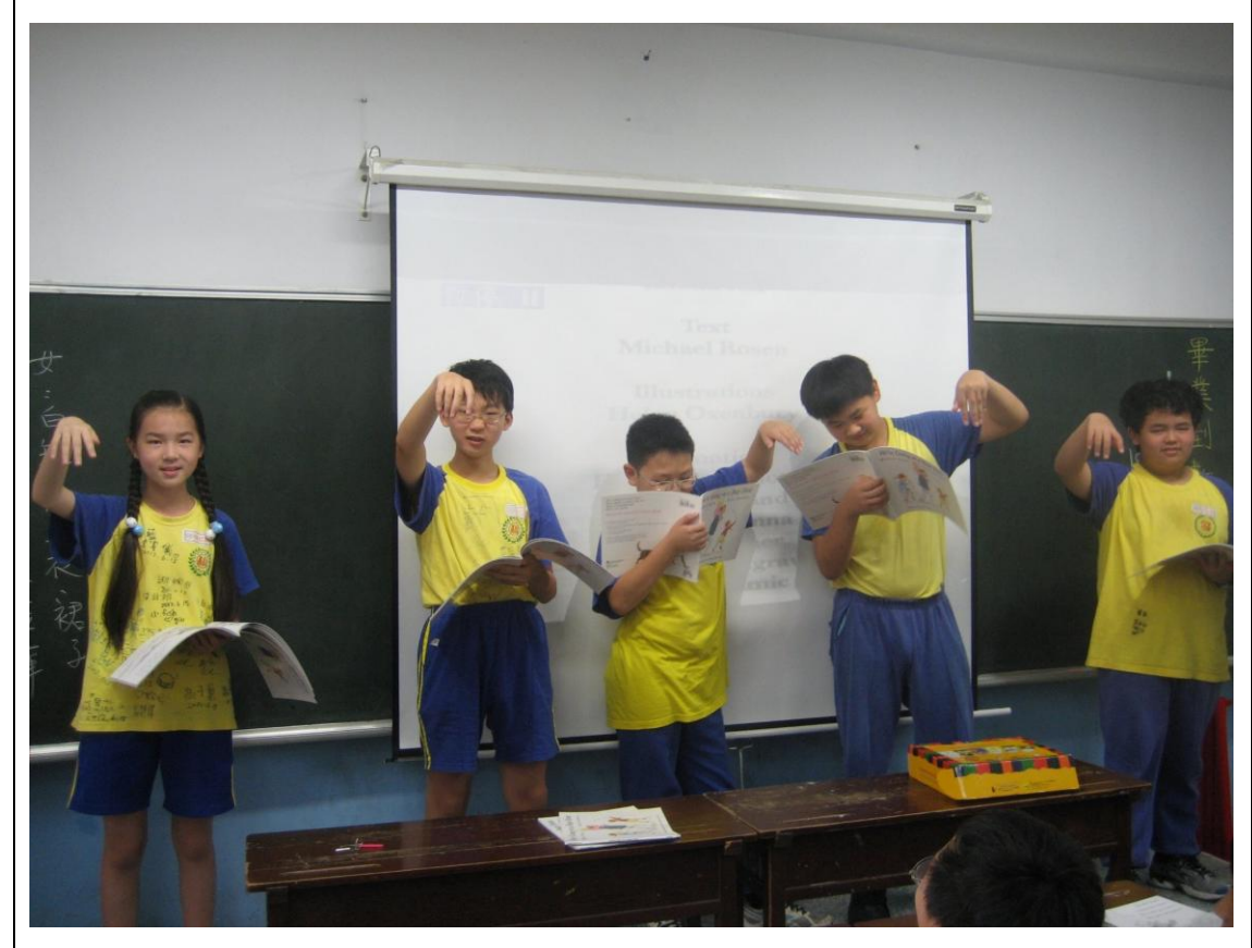
RT: We can't go over it!