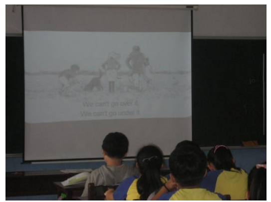
Students watch the DVD