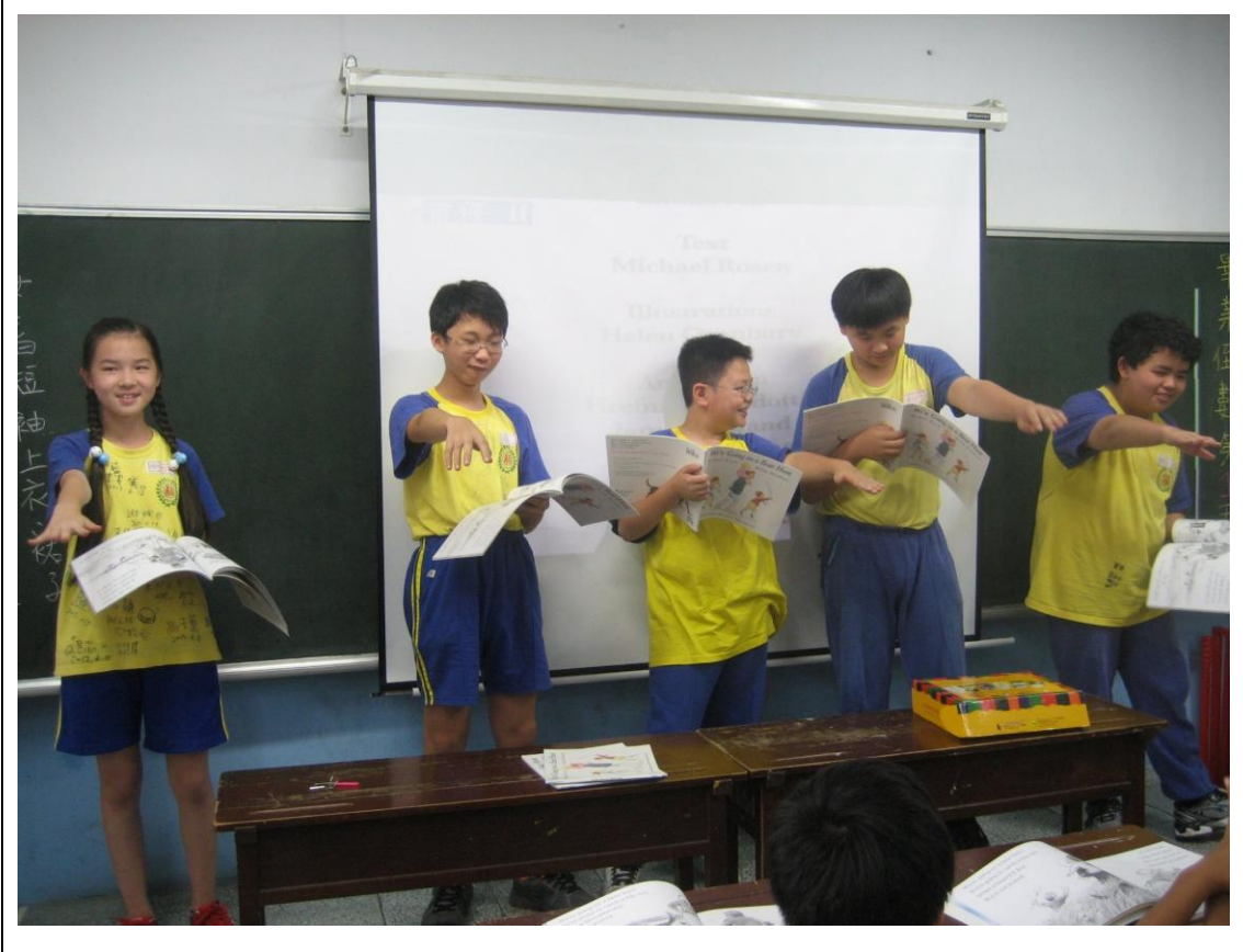
RT: Oh, no! We've got to go through it!