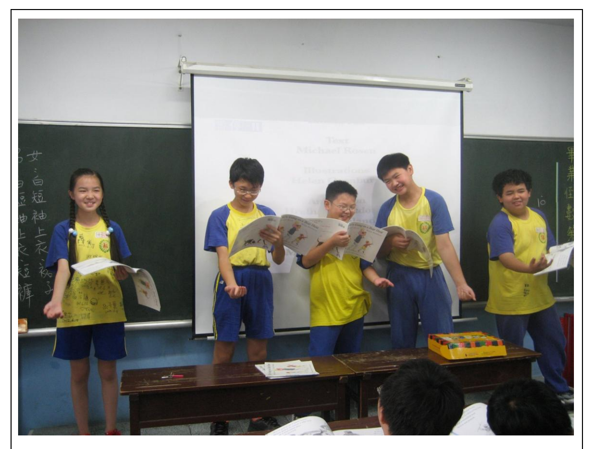
RT: We can't go under it!