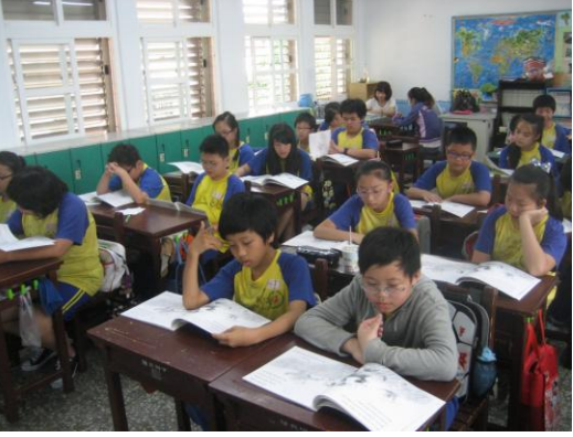
Students look at the book and listen to the CD